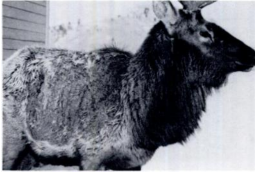
FIGURE 1. Adult male elk from the National Elk Refuge, Wyoming, with severe psoroptic scabies.

ent on elk with scabies, but lice were present on five other elk and abundant on two calves (Table 1).