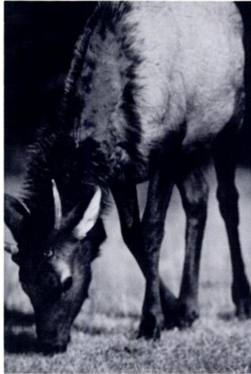
FIGURE 3. Yearling male elk from Banff National Park, Alberta, with winter tick-induced alopecia.

Mites of the genus Psoroptes are pests of wildlife and domestic animals in many countries (Lange et al., 1980; Welch and Bunch, 1983; Kirkwood, 1986; Cole and Guillot, 1987). The effects of Psoroptes sp. on elk have not been studied as extensively as those of Psoroptes ovis on domestic cattle (Stromberg and Fisher, 1986; Stromberg et al., 1986; Cole and Guillot, 1987; Stromberg and Guillot, 1989), but pathogenic events are probably similar. Severity of clinical disease in cattle is determined by mite density (Stromberg et al., 1986). Adult female mites lay many eggs in a short time and in cattle at least, mite infestation can result in severe exudative dermatitis and death 7 and 9 wk after infestation, respectively (Cole and Guillot, 1987). Domestic cattle with >15% of the skin surface manifesting dermatitis have reduced daily weight gains while those with 40% or more of the skin involved may die